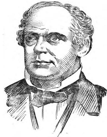
“Salmon P. Chase as Senator,” Taylor, William A., Ohio in Congress from 1803 to 1901, with notes and sketches of senators and representatives. D. 69.

Chase’s colleagues in the newly-formed Republican Party, the Compromise of 1850 further strengthened the Fugitive Slave Act of 1850. The federal legislation required return of slaves to those who claimed them as property, whether or not the individual was found living in a “free” state, thus superseding control at the state level.